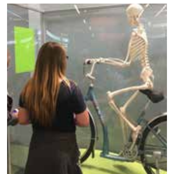
on the cover: