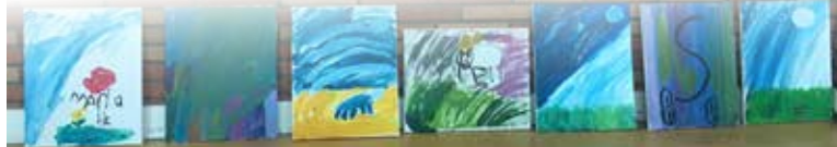
Art display at Maryvale's Art Center.