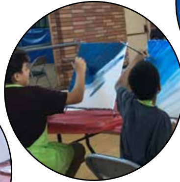
First, the sky