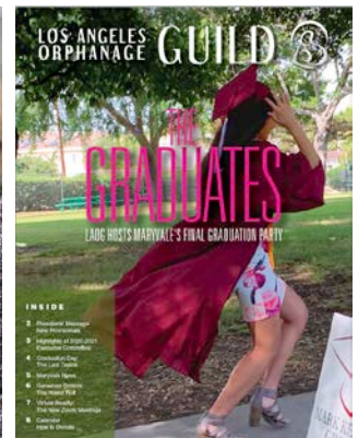
on the cover: